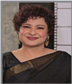
Ms. Sania Saeed