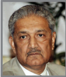
Dr. Abdul Qadeer Khan