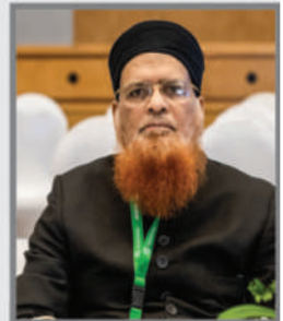
Mufti Taqi Usmani