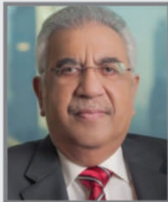
Mr. Sadruddin Hashwani