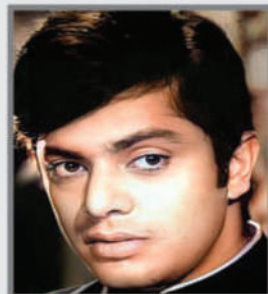
Mr. Waheed Murad