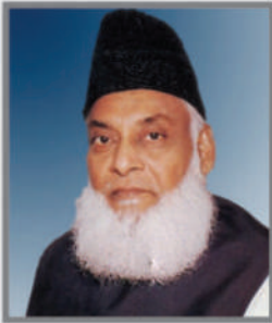
Dr. Israr Ahmed