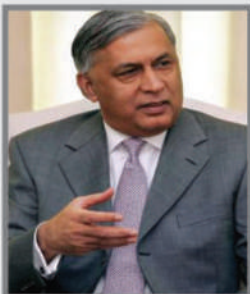
Mr. Shoukat Aziz