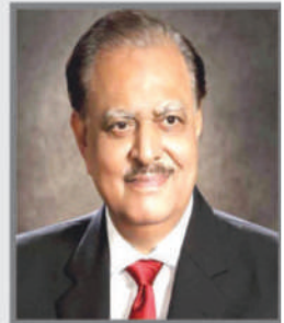
Mr. Mamnoon Hussain