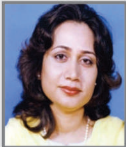
Ms. Parveen Shakir